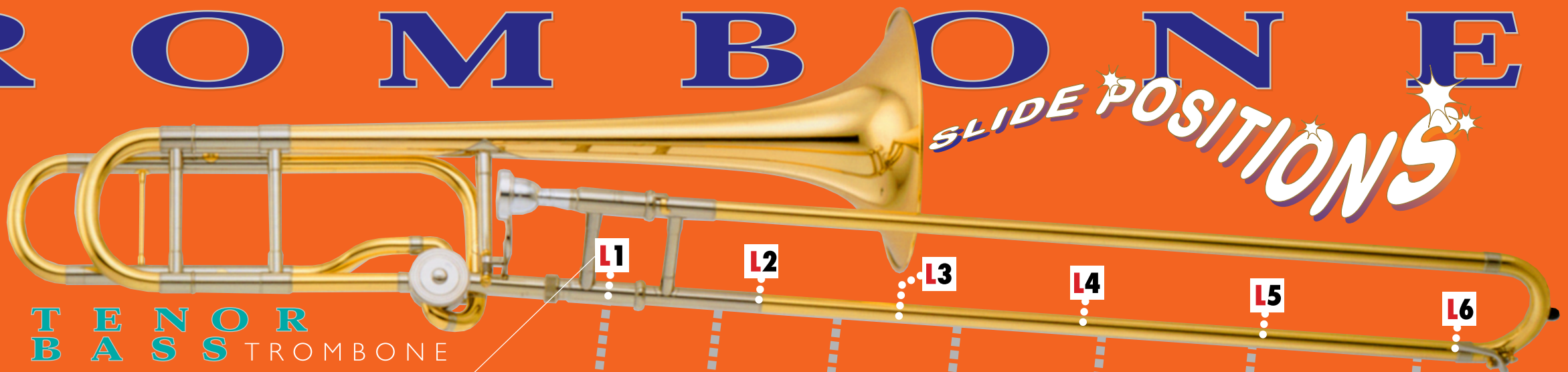
TENOR BASS TROMBONE